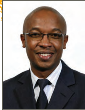
Mpho Parks Tau Executive Mayo