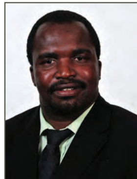
Dan Bovu Housing